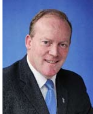
Conor Lenihan, T.D.

I am pleased to present this Annual Report on the activities and achievements of the Department of Communications, Energy and Natural Resources during 2009.