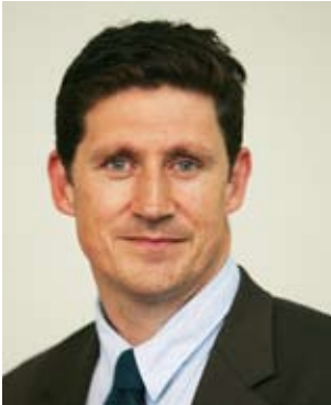
Eamon Ryan, T.D.